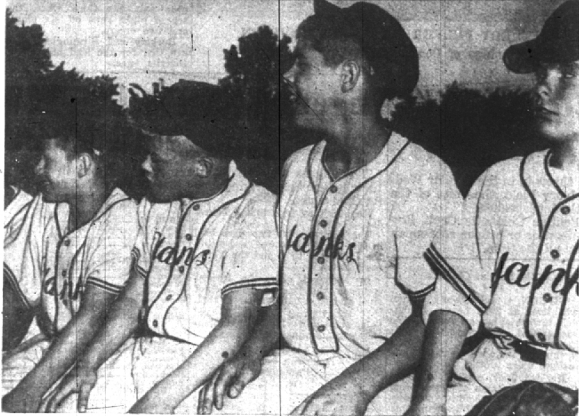
BENCH WARMERS WAIT FOR THEIR TURN TO SHOW STUFF