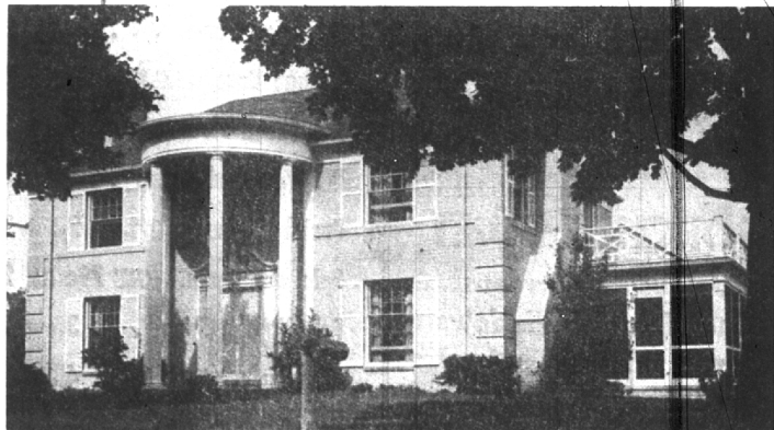
Above: A truly exceptional home, in Bloomfield Village.

The carpets are included in this fine value at $25,000.