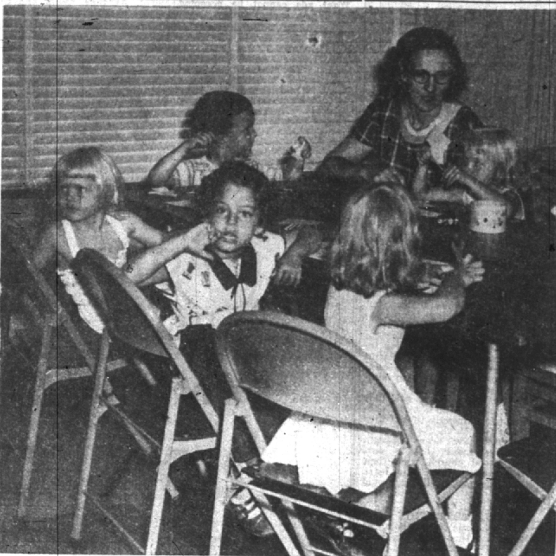
CONTINUING their vacation Bible school a little longer than the other churches in Birmingham, youngsters at Ascension Lutheran on 14 Mile, are still busy at projects. These tots divide their attention between the camera eye and their instructor, who is giving them a few pointers in making cut-outs and coloring them. This particular school, which opened June 21 operates a month rather than the customary two weeks.