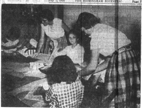
AMONG THE 1,000 or more Birmingham children taking part in the vacation Bible school program, are these boys and girls of the United Brethren church on 14 Mile road. Youngsters get a helping hand from teachers as they work on the lesson books of illustrated Bible verses. The books are first crayon colored, then cut out for additional work. Small charms are awarded to the group for attendance and work.