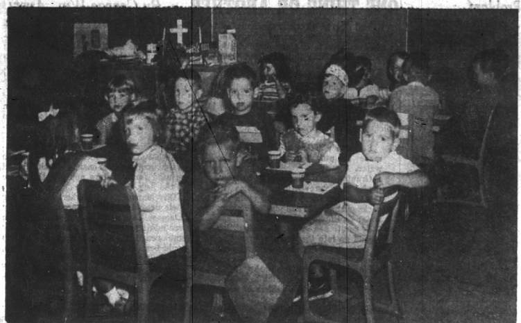
AT THE FIRST Presbyterian church vacation Bible school it was time out for a morning snack. Youngsters, hungry from a morning of study and play, waited patiently until their teacher gave the word to get on with their lunch