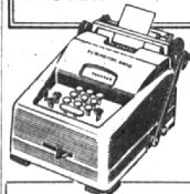
FIGURE TAXES FASTER