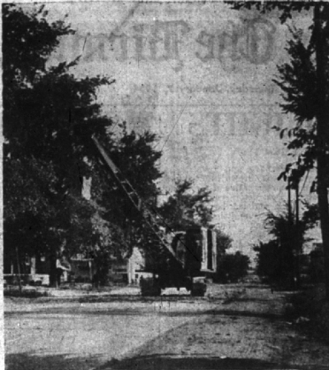
MID-SEPTEMBER SAW the break up the concrete for removal, since the breaking up job seemed to have been pretty well accomplished by automobiles over the past few years.

Issue of Aug. 6 First step in assuring Birmingham (Continued on next page)