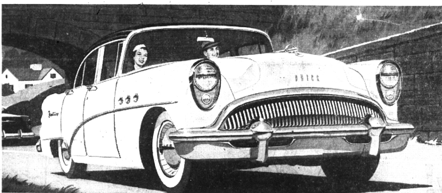
The phenomenal 200 hp Buick Century—highest-powered car of its price in America.