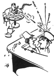
"He said there'd be war the next time I forgot the Angostura!"

Elementary schools participated as follows: Terry, 123 students, $113.19; Franklin, 64 students, $105.75; Walnut Lake, 70 students, $147.31; Bloomfield Village, 86 students, $182.32; Pierce, 315 students, $204.76; Adams, 208 students, $312.84; Quarton, 178 students, $629.13; and Baldwin, 207 students, $321.73.