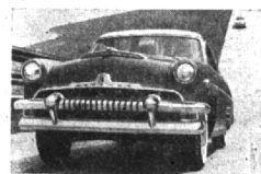
Make driving as easy as you wish with optional power steering, power brakes, 4-way power seat, electric power windows, no-shift Merc-O-Matic Drive.