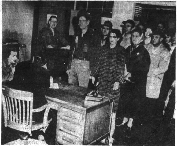
THE INTERNAL REVENUE department's new office on the second floor of the Huron Building, 53 1/2 West Huron. Pontiac, is a busy place these days as citizens line up for help in filing their 1953 income tax return before the March 15 deadline. The new office is staffed by 20 consultants, and approximately 50 returns an hour are being processed. District Director A. M. Menninger said all citizens are invited to come to the office for help in making out their returns. He cautioned that persons must bring all necessary data and records with them.