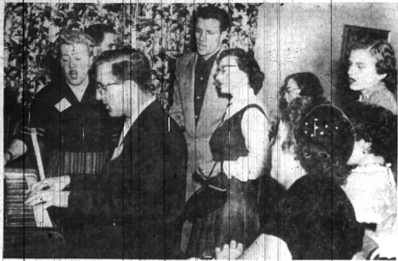
METROPOLITAN ACTIVITIES MEMBERS AT OPEN MEETING Singing knows no physical handicap.

"Are you thinking of buying a new home? Then read the 'For Sale Houses' columns on the Classified Ad page of this week's Eccentric."