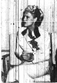
MARGARET Houcke-White , noted photographer for Life Magazine, was guest speaker at Friends of Baldwin Library on April 20.

Issue of March 25 A record 1954-55 budget of $2,394,320.51 was approved Monday night by the Birmingham board of education. The figure includes a salary increase for teachers. Combined assessed valuation of three area communities has jumped nearly 8 1/2 million during the past year. Complete totals on assessed valuations for Birmingham, Bloomfield Hills and Larchmont show an increase of this amount over the 1953 total of $56,362,465. Sudden upswing in crime in Birmingham during the past year has been traced to greater incidents among juveniles, according to Police Chief Ralph W. Moxley. There were 163 youngsters involved with the police, compared to 95 last year. Widening and paving of W. Maple from Linden to Glenhurst may be included in this summer's paving contracts if Oakland county road commissioners can legally enter into a contract with the city on an anticipated revenue basis. (Continued on Next Page)