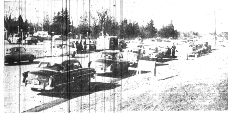
PUZZLED MOTORISTS on Feb. 17 and 18 found themselves channeled into two lanes on Woodward at Quarton road as Michigan Turnpike authority workers checked point of origin and destination of every vehicle that passed the check point. Traffic northbound was

clinic and administration offices. Funds for construction of the school were assured by the sale of $1,750,000 worth of bonds by the district on Jan. 29.