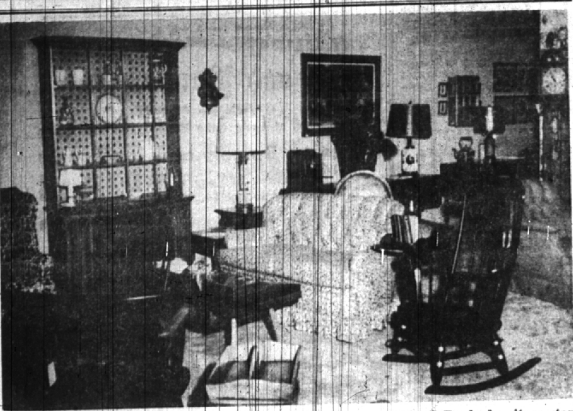
PICTURED HERE IS ONE of the showrooms of the new John J. Brady furniture store at 4062 W. Maple near Telegraph. Featuring hand rubbed pine furniture and occasional pieces, the store also carries other period furniture, lamps and pictures. The new building is the latest to be added to the growing commercial strip on the northeast corner of Maple and Telegraph.