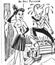
"Why get so excited about a few bills? We've got lots of them!"

As brightly as the Star of Bethlehem on that Holy Night.