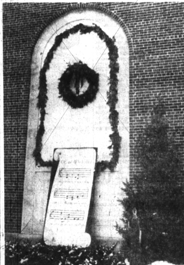
EXTENDING CHRISTMAS greetings throughout the Lathrup area, Community Church congregational, has erected this large scroll of the well known Christmas hymn, O Come All Ye Faithful, facing Southfield road. Spotlighted at night, the scroll and several figures from the Nativity scene which are nearby, make up one of the most attractive Christmas scenes in the area.

Lutheran Church of The Redeemer WEST MAPLE NEAR CHESTERFIELD Christmas Services FRIDAY, DECEMBER 21:— Children's Service 7 P.M. Midnight Service of Lights and Carols 11:30 P.M. SATURDAY, DECEMBER 25:— Christmas Day Service 10:15 A.M. SUNDAY, DECEMBER 26:— Worship Services at 9:30 and 10:15 A.M.