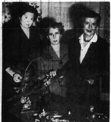
LINE AND COLOR MARK YULETIDE DECOR Garden Clubwomen share holiday ideas.