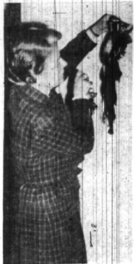
YULE WREATH IDEA Leaves held in coathanger.