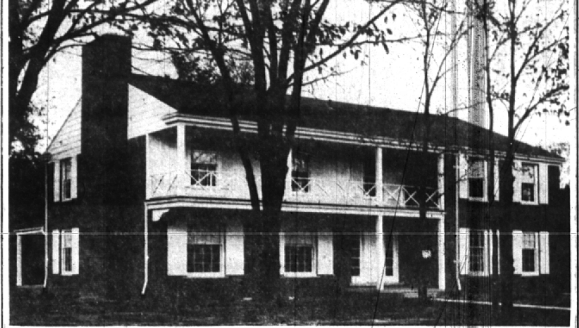
BURNING BUSH AT HUPP CROSS

This home, framed by stately elms, is truly a picture of dignity and gracious living. An aristocrat of custom colonials devoted to detail in which you will find a distinctive wrought iron stair case, an elegant white marble fireplace in the master bedroom, designers bathrooms, swedish fixtures, an intricately paneled living room fireplace and dome heading, expertly planned and equipped kitchen, unique grilled domes in the pine paneled breakfast room, and many more custom features. This five bedroom, 3 bath home may be seen daily from 2:30 or by appointment.