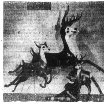
3 Sizes of Deer

Make this Christmas one to be long remembered—secure a Christmas display for your home, office, church, plant, etc. . . . Complete sets or starting pieces. . . . You will be amazed at the beauty of these beautiful creations and the low cost at Christmasland.