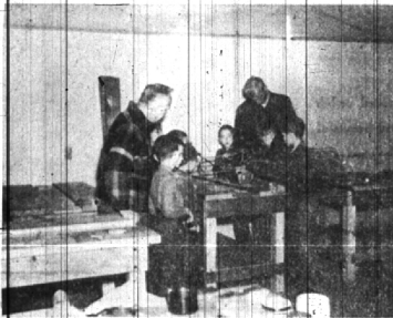
A complete craft shop was instituted and equipped at the Birmingham YMCA on Lincoln Street. It is now in operation under the direction of a trained staff of instructors that are donating their services in this program.