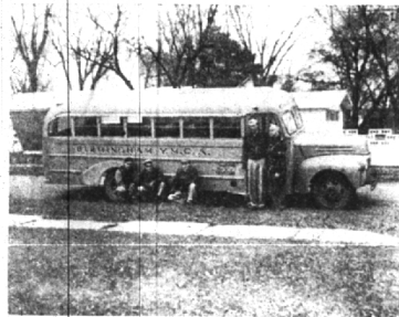
A 44 passenger bus was purchased for the purpose of transporting boys and girls to and from summer camps, as well as to the many other field activities in which YMCA youth groups participate throughout the year.