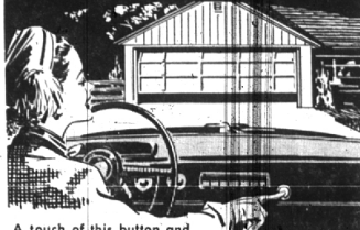
A touch of this button and the garage door opens or closes.

Safely after dark, comfort in bad weather, convenience every time she drives in or out... these are the gifts you give with a Scientific Garage Door Operator. No need to leave the safety of the car... a touch on the button operates the garage door and turns on the flood light. Here is safety and comfort, day and night, in any weather.