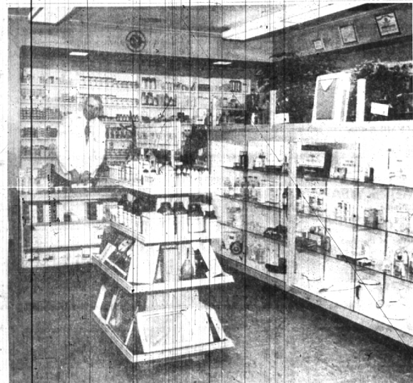
THE PRESCRIPTION CENTER , the second pharmacy operated by Mark Beers, Birmingham druggist, has opened in the new Reid Building on the east side of North Woodward between Oak and Harmon. The store, at 624 N. Woodward, carries a complete drug stock and prescription services in the new clinic and office building. Complete from the traditional apothecary jars in the window complementing the modern birch interior, the store will be open from 9 a.m. until 6 p.m. Monday through Saturday. In the picture is Manager Ray Jensen.