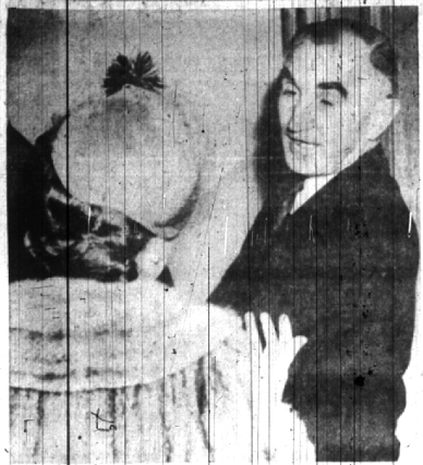
INDEPENDENT SENATOR Wayne B. Morse of Oregon, at Community House Dec. 8 called for political integrity among the nation's lawmakers. Sponsored by the Birmingham branch of the American Association of University Women, the senator charged many of his fellow legislators with voting against their real convictions on important issues. Details of his address are on Page One, Section One.