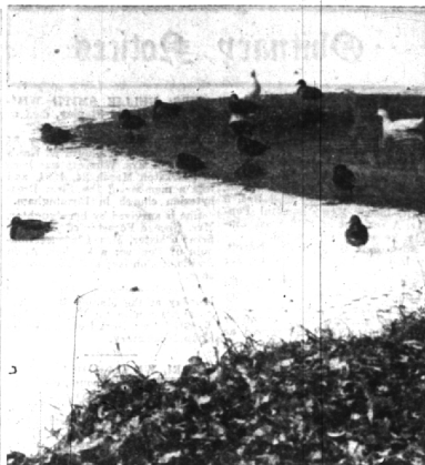
TALK ABOUT TEAMWORK in industry, these Quarten Lake ducks are the living example of teamwork for preservation. The hardy web foots, who are sticking close to the small pond this year, managed to keep a small area of water from freezing over by taking turns breaking off the gathering-ice and swimming about to keep the water agitated. The hole the busy creatures are protecting, however, adds to the dangers of skaters who have already taken to the pond for outdoor fun. Youngsters attracted by the ducks are tempted to skate too close to the open water and police fear this skating hazard.

Each year these young people visit the club to present a program of Christmas music. On Dec. 29, members will entertain their youngsters at a special program. According to club reports, the entertainment will be planned to please all children, little tots and nearly-grownups. Want Ads cannot be accepted after 5 p.m. each Tuesday.