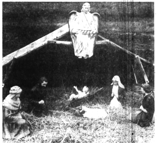
The lowest price life-size, full round outdoor Nativity Scene ever offered.

The Ideal Donation To Give Your Church or Civic Group, In The Community Interest.