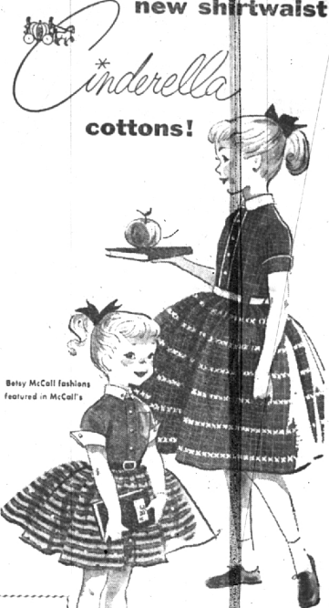
Betsy McCall fashions featured in McCall's

Did you ever see a dream walking to school? You will — just send for off in one of these new Cinderella cottons! Both have little-boy collars, whirling skirts and a way of washing store-fresh. Left: solid color atop dot-dot stripes, tie-pin and cuff-links, sizes 6-6x and 7-12. Right: shadow checks woven with a patterned stripe, sizes 6-6x and 7-14.