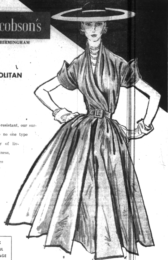
DRESS SALON — STREET LEVEL

Splendidly draped and wrinkle-resistant, our surplus-front dress is limited to no one type of personality, figure or way of living. All softness and comeliness, yet chic and urban . . . it goes everywhere from luncheon in town, to club, to afternoon tea and on. Beige, grey or navy. Sizes 10 to 18. 29.95