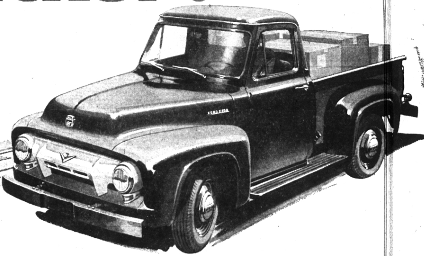
New Ford F-100, 6 1/2-ft. Pickup, 4800-lbs. GVW, shown with standard Driverized Cab. Deluxe available at extra cost.