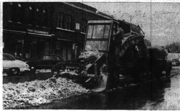
THE MACHINE PICTURED ABOVE, which is owned by the Wolverine Tractor and Equipment company of Detroit, came to the rescue of the Birmingham DPW Tuesday when its own snow removal machine broke down. The city has recently been studying the possibility of buying such a machine and the company had offered to demonstrate its product. With the city's machine broken down and the streets full of snow, Tuesday seemed like a good day for the demonstration. The company was called and a machine was sent out along with an operator and the snow removal operation proceeded.