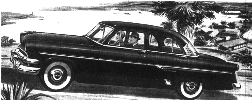
The new I-block Six-Fordomatic Drive combination is available in any of Ford's 14 body styles. Illustrated is the Customline Six Fordor Sedan.