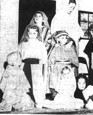
STRICKEN MOURNERS at CHRIST'S TOMB Typical scene from Easter drama