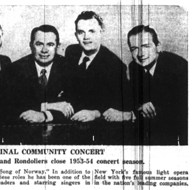
panies of three of Broadway's finest musical shows, "Annie Get Your Gun," "As You Like It" and "The Boy in the Woods."

Charles Kullman and Rondoliers close 1953-54 concert season.