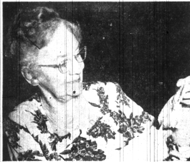
Give rest to the AGED . . .