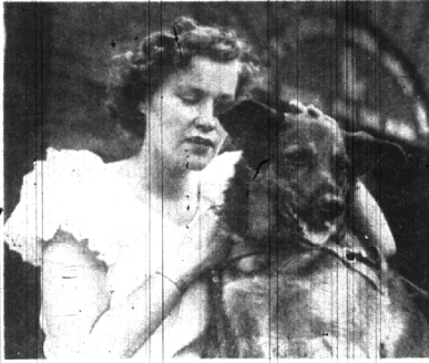
Give eyes to the BLIND . . .