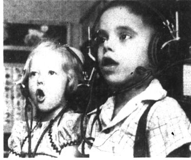
Give hearing to the DEAF . . .