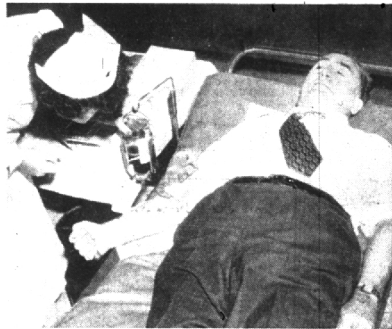
Give blood to the WOUNDED and INJURED.