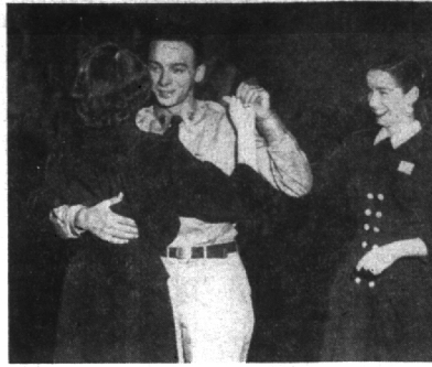
Give cheer to the HOMESICK . . .