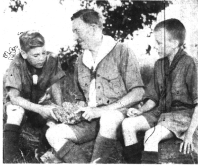
Give guidance to YOUTH . . .