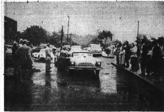
A SLEEK CUSTOM-MADE sports car is checked by the official starter before starting on the "Press on Regardless" driving competition from the MacManus, John and Adams parking lot in Bloomfield Hills Saturday morning, Sept. 19. The test of driving skill that attracted about 10 sports car drivers included a series of check points spotted on the route from Bloomfield Hills to Grayling, Mich., where members of the Detroit Region of the Sports Car Club of America, met for a weekend of entertainment and more driving tests.