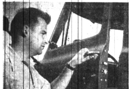
SWING open the new wider doors! Door handles are the easy-operating, push-button type . . . the kind you get on quality cars. Door latches are new rotor type.

Before you buy any truck . . . make the 15-second SIT DOWN TEST! You can see and feel instantly, how Ford has combined truck ruggedness and performance with the comfort a driver deserves!