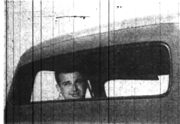
GLANCE back through the 4-ft. rear window. See where you're backing without leaning. Ford Trucks have more glass area than any of the five other leading truck makes.