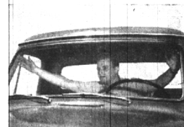
SWEEP your eyes across the new curved one-piece windshield. With picture-window visibility like this you can really navigate. Safer driving, of course! Less eyestrain!