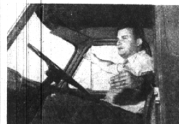
STRETCH your arms into big-cab roominess. Ford's got more hip room than any of the five other leading makes. Man, what a treat this cab is for a working guy!