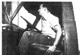
SLIDE into the wide, comfortable seat. Bounce on it to test the super-cushioning action of Ford's exclusive seat shock absorber and new non-sag springs.