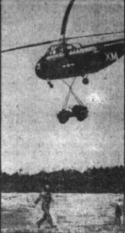
PARK HERE —Coming down for a landing is the Marine's "Mighty Mile" dangling on a line suspended from a Marine helicopter at Quantico, Va. Credited with being able to do everything but fly, the motor vehicle is 1000 pounds lighter than a jeep.

Branch Bank Gets Parking District Rezoning of two lots, tentative vacation of an alley, and approval for an exchange of property has cleared the way for the construction of a new modern, drive-in branch of the Birmingham National Bank and a new service station on S. Woodward, both between Bird and 14 Mile roads. To provide off-street parking facilities, the city commission rezoned a lot on Bird street at the rear of the branch bank's proposed site from a single residence classification to a parking district, the city's first such zone under a recent zoning ordinance amendment. News copy submitted early is necessarily given preference, so the "early bird" usually gets the space.