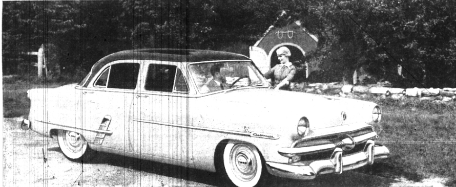
Come in and see . . . value check . . . and test drive a Ford today!