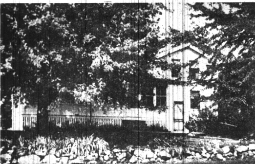
AND TO RICH FERTILE ACRES!

Wide open spaces... clean, fresh air... here you're the master of all you survey... your kingdom is left and right and all about you. The complete solution for a healthy family... live in the country!