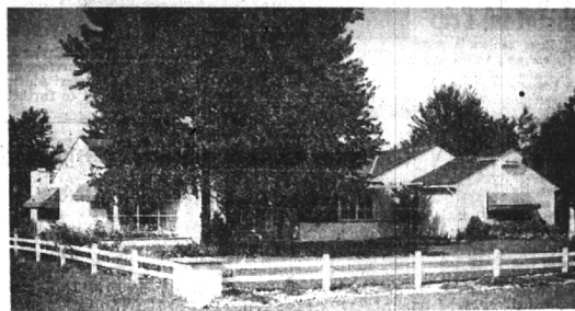
On Lantern Lane

You'll love Foxcroft... with its charming homes... its spacious grounds... and its atmosphere of peaceful country living. You'll especially like this home — 1950-built — and in excellent condition. There's a "happily-living" contained here.