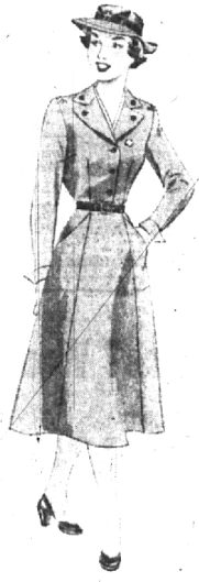
ADULT GIRL SCOUT

Mulholland's again wish to honor the Girl Scouts of the Birmingham area and to pay respects to their leaders who are so efficiently conducting the Girl Scout program in our community.