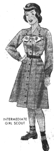
INTERMEDIATE GIRL SCOUT