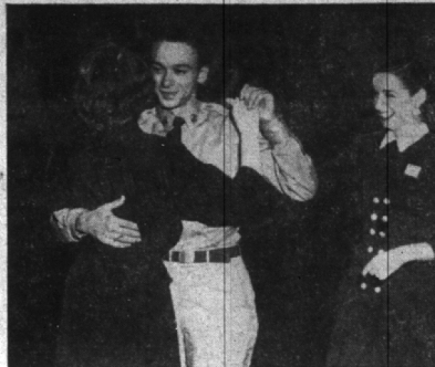
Give cheer to the HOMESICK . . .