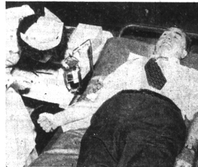
Give blood to the WOUNDED and INJURED.