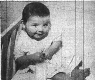
Give shelter to the HOMELESS . . .