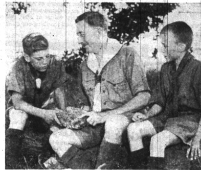
Give guidance to YOUTH . . .