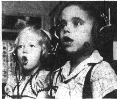
Give hearing to the DEAF . . .