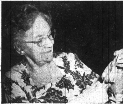
Give rest to the AGED . . .