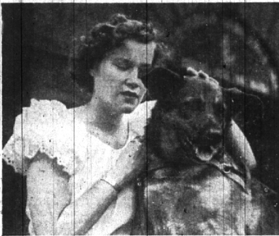
Give eyes to the BLIND . . .