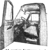
16 custom features at only slightly extra cost are yours in the Deluxe Drivertized Cab (shown).

New curved one-piece windshield, new 4-ft.-wide rear window, new arm-rest deep side windows, yard-wide door opening, big 3-man comfort seat with non-sag springs and new exclusive seat shock snubber! All new! Sit in it for just 15 seconds at your Ford Dealer's—you'll know the Ford Drivertized Cab is the one for you!