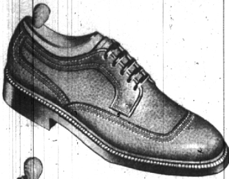
Golden Birch Long Grain $19.95