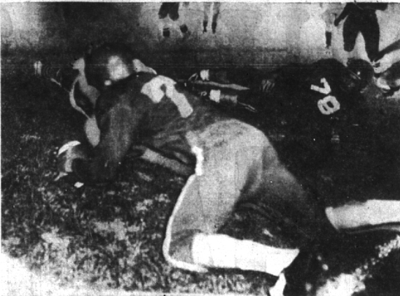
MAD SCRAMBLE FOR LOST BALL IN FIRST QUARTER OF FERDALE GAME. Unidentified Maple lineman wins possession after Ferndale fumble.