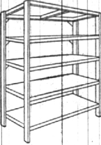
PRESERVE and VEGETABLE SHELVES

Rows of canned fruits and vegetables to make any housewife proud... especially when neatly stored on these sturdy Presdwood built shelves! We'll gladly supply the how-to-do-it. All you need is a little time, lumber and easy-to-cut, easy-to-nail panels of genuine Masonite Presdwood.