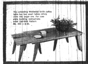
This extending Weldwood birch coffee table has two small tables which slide into larger one. For complete building instructions order Easi-Bild Pattern No. 452—$5.00.