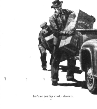
Deluxe (extra cost) shown.

BIG LOADSPACE! Loads easier, faster! New stronger bolted-construction Pickup box, with 45 cubic feet of payload space, no wheelhouse obstructions! Stronger, more rigid tailgate resists bending under heavy loads! New exclusive Ford tongue-type latches clamp tailgate shut tight!