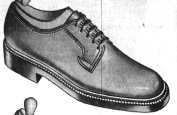
Brown Puritan $23.95 Calf