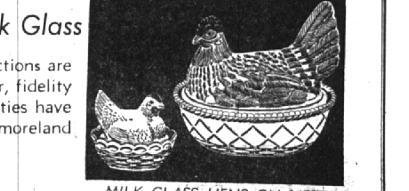
MILK GLASS HENS ON NESTS Large hen is 7 inches long; the small hen 3 inches. Small . . . 75c Large . . . $1.90