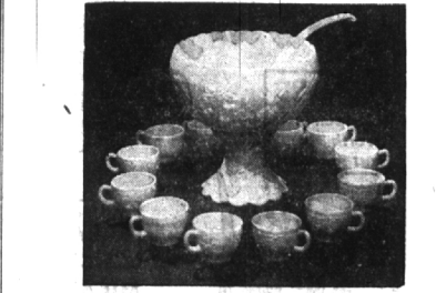
HANDMADE MILK GLASS PUNCH SET Elegant, family size, 15 piece punch set. Consists of punch bowl, matching pedestal, ladle, and twelve punch cups. $23.75 SET