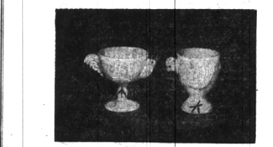
MILK GLASS SHERBET AND EGG CUPS Two handsome, hand decorated Westmoreland Milk Glass items that are constantly in the spotlight. Sherbet . . . $1.50 Egg Cup . . . $1.30

Illustrated here are just a few of the hundreds of pieces on display.