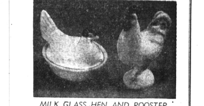
MILK GLASS HEN AND ROOSTER Standing rooster 8 1/2 inches high with brilliant red comb, yellow feet. Hen has red comb, then are also available in five other sizes and designs. Hen . . . $1.90 Rooster . . . $3.25