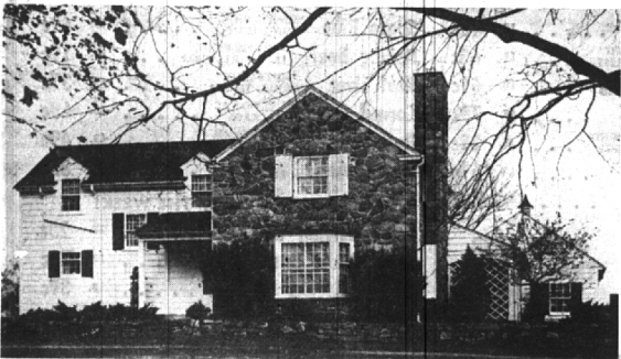
In Franklin Village.

A comfortable, "homey" air permeates this attractive residence and immediately puts you at ease. Delightfully decorated, you'll find all rooms spacious.