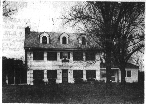
NEAR THE SCHOOL

Paddock fenced . . . 1 1/2 acres . . . An attractive Kentucky Colonial in Michigan!