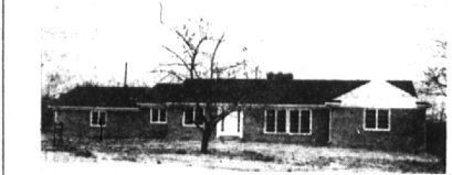
LONE PINE AT LAHSER

A scenic, orchard site... staunchly built... solid masonry. Full Dining Room... first floor Activities Room... 2 fireplaces... 3 Bedrooms. Prime fruit trees... over an acre... low taxes... a spotless new home!