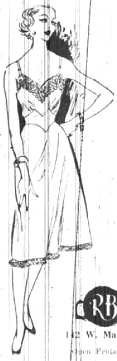
Right: RAYON FRONT AND BACK SHADOW PANELS $3.98 Also in sizes 32 to 40 and White only. Front and back shadow panels. Cotton lace trim.