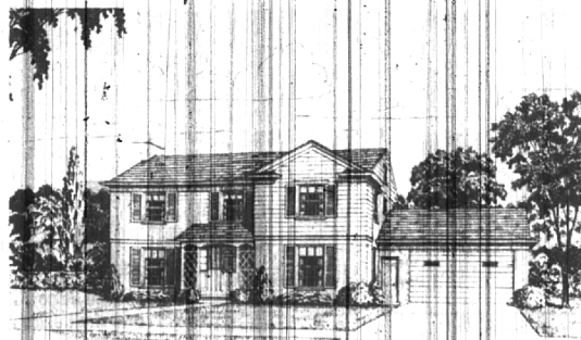
1298 North Glenhurst Drive

If you want three large bedrooms and two tiled baths. Bat room tiled lavatory, dressing room off Master bedroom, large paneled library, see us for further information regarding this large colonial farmhouse.