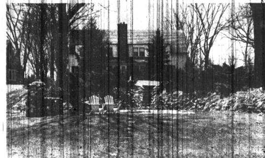
VERDANT LAWN TO THE SANDY BEACH!

Shimmering waters . . . a cool breeze gently wafting in on a hot Summer's day. Forsake the steaming city for perpetual vacation! Here is a sparkling year 'round Colonial with 100 feet of frontage on Pine Lake.